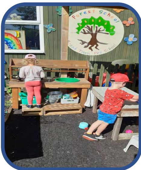
This is our small outside play area where we play with our mud kitchen, sand and water