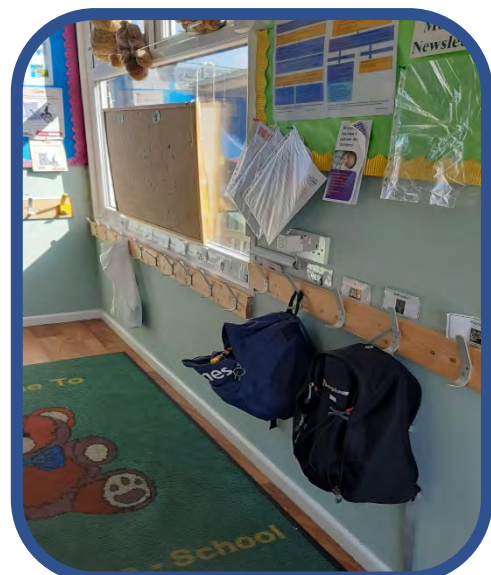
This is our cloakroom where you will find Your name and hang your coat and bag