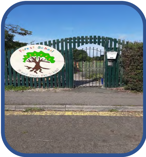
This is the entrance gate to Pre-School.