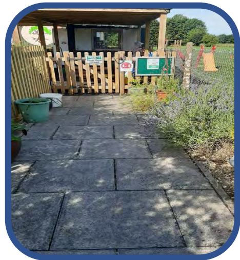
This is the path which leads you to our sheltered play area and the classroom